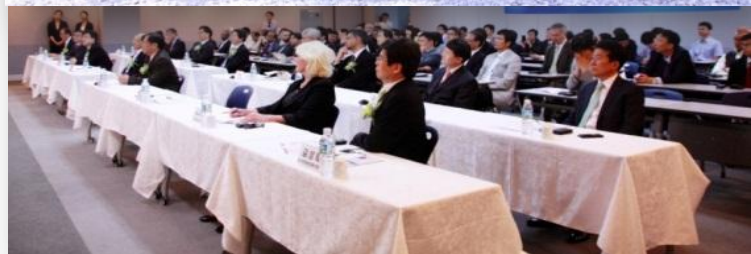
2013 KOREN FORUM WORKSHOP